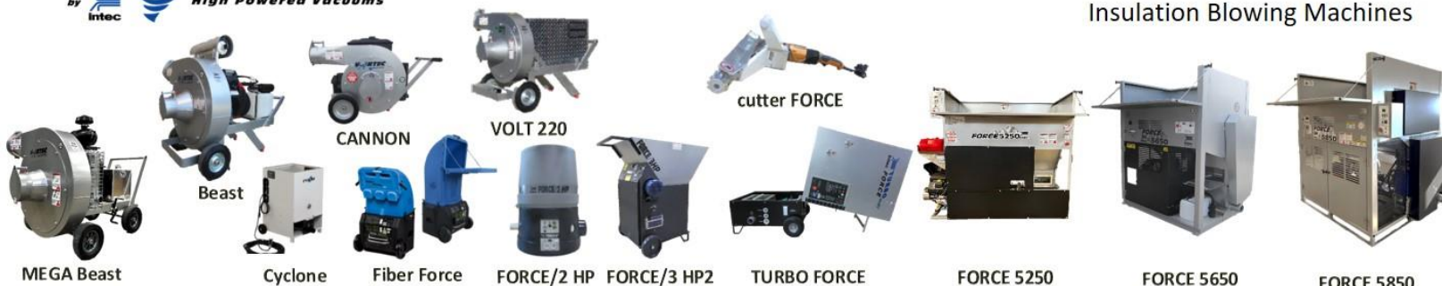
MEGA Beast Cyclone Cannon VOLT 220 Fiber Force FORCE/2 HP FORCE/3 HP2 TURBO FORCE FORCE 5250 FORCE 5650 FORCE 5850