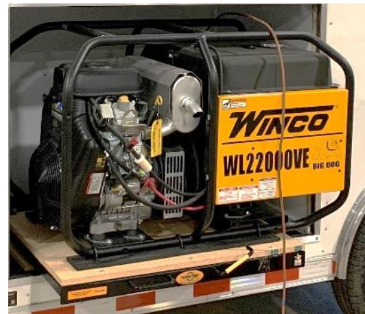
Slide Out – options available Part #: 77045-00 or 77046-00