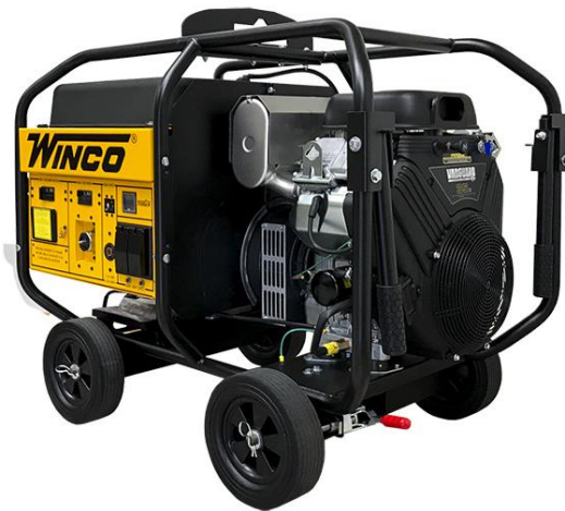
Wheel Kit Part #: 77002-16