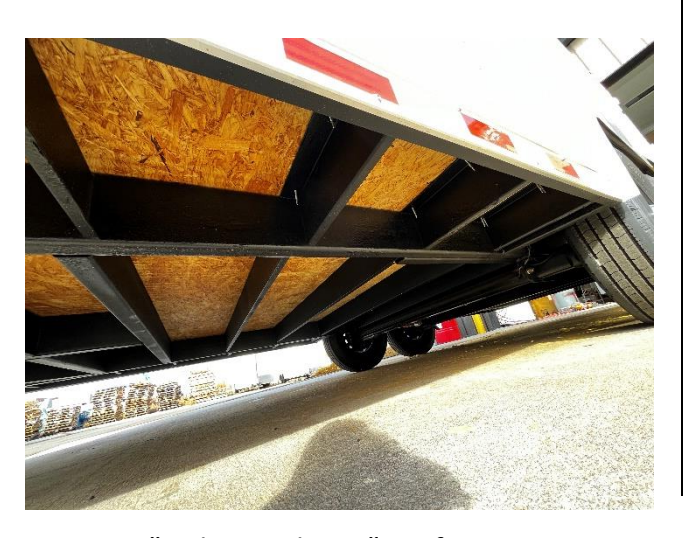
6" Tube Steel – 16" OC framing