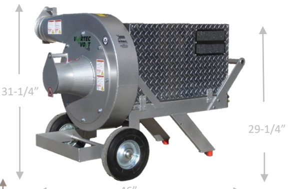
Electric High-Powered Vacuum