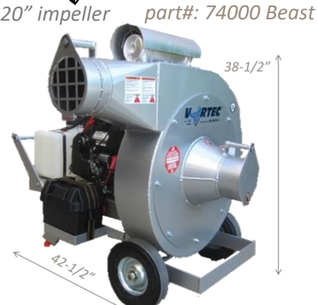
POWERED by HONDA or KOHLER