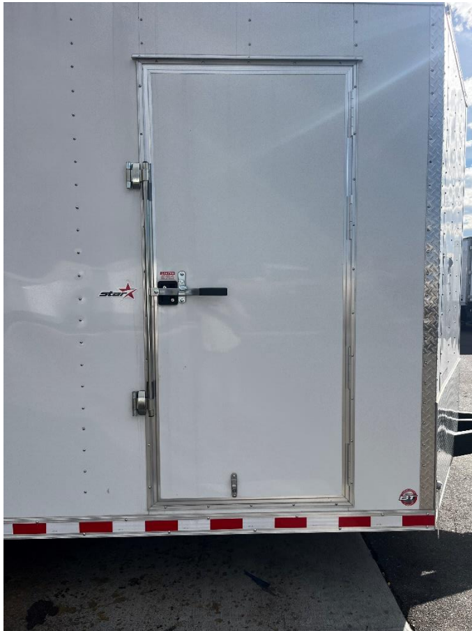
Passenger side view with 36" wide door