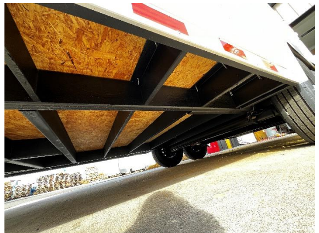
6" Tube Steel – 16" OC framing