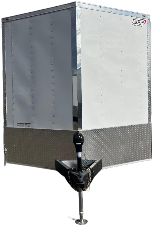
Front View ✓ 24" stone guard ✓ Electric Tongue Jack