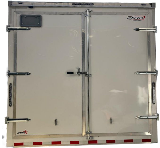
Rear View ✓ Cargo Doors ✓ Bar latch ✓ Chrome BezelLED Lights