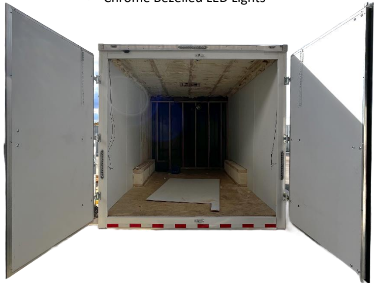
Rear View ✓ Insulated Cargo Doors ✓ White Vinyl Cover ✓ 7-1/2' interior height