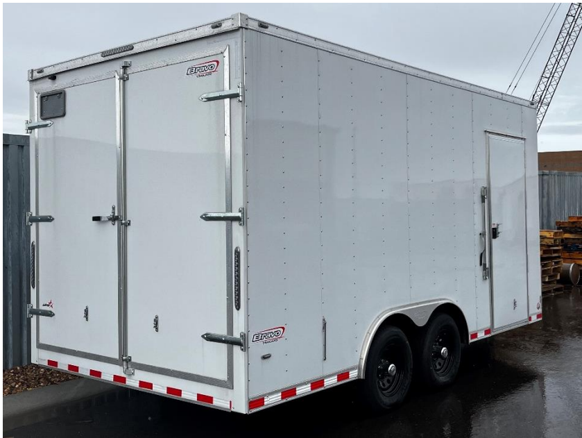
Rear Passenger Side Black rims with stainless steel center caps