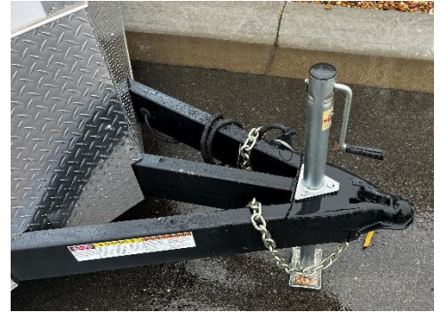
60" Tipline Tube Tongue 2-5/16" coupler Manual Jack standard; Electric optional