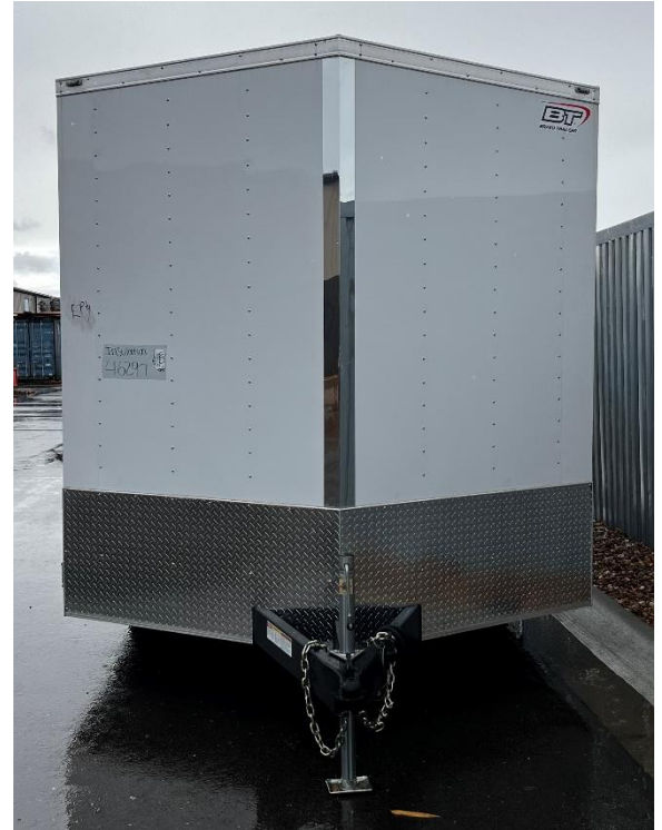
Front – 24" stone guard