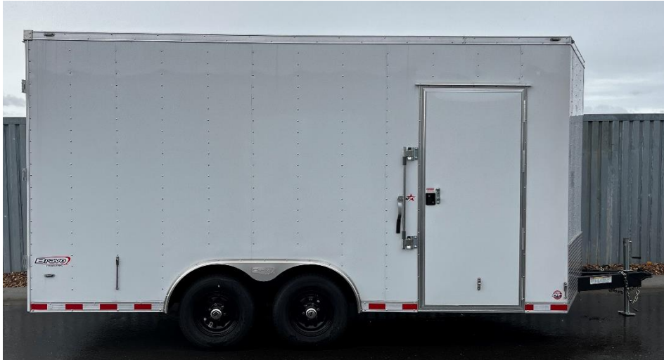
Passenger side view with 36" wide door