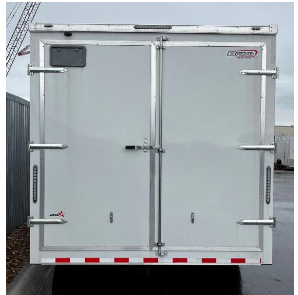
Rear – Insulated Cargo Doors with bar latch Chrome BezelLED lights