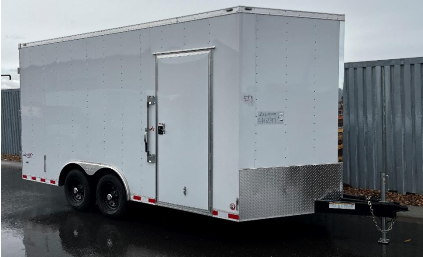
Front Passenger Side view 12" extra height places interior at 7-1/2' tall