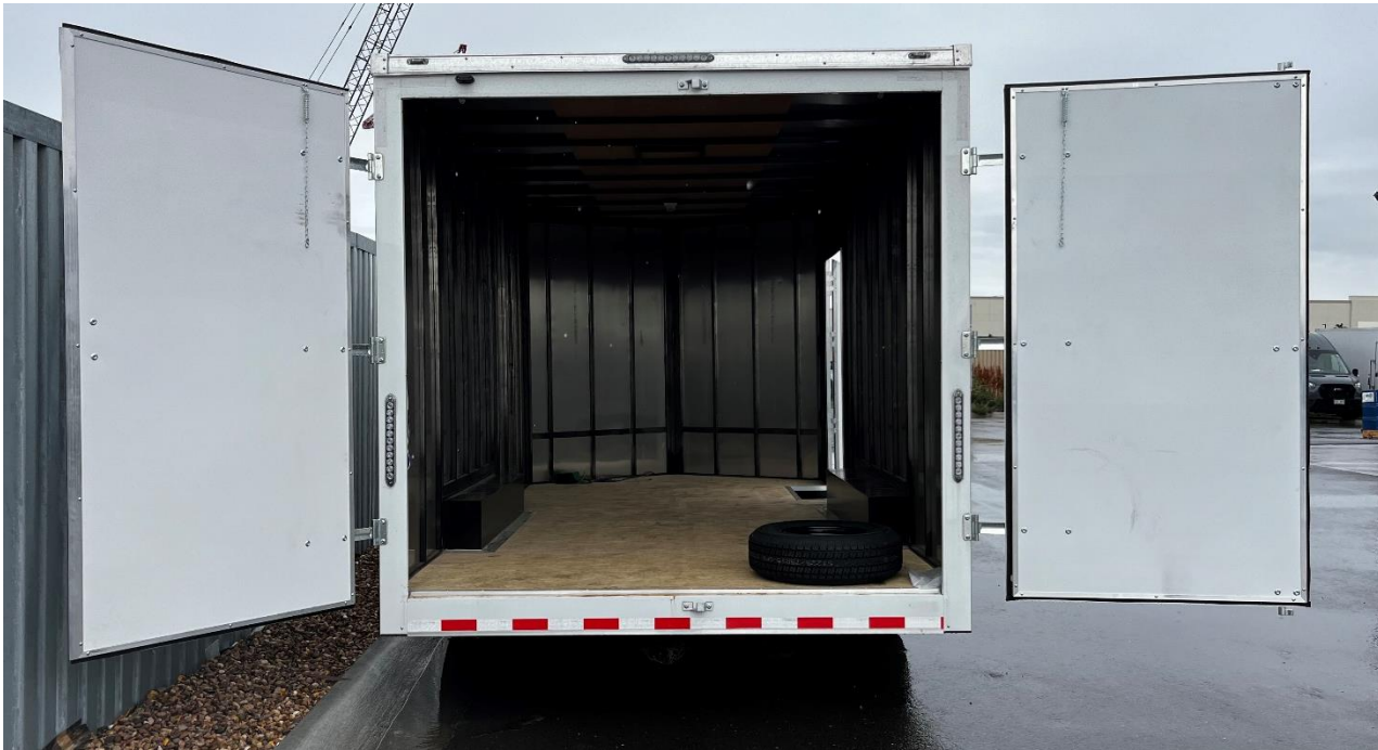
Rear doors insulated and covered with vinyl