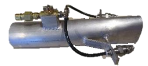
Large spray nozzle selection