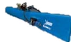
Part#: K3200 2" inlet