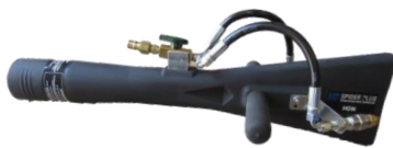
JM Spider PLUS HDN Part#: J53050-S