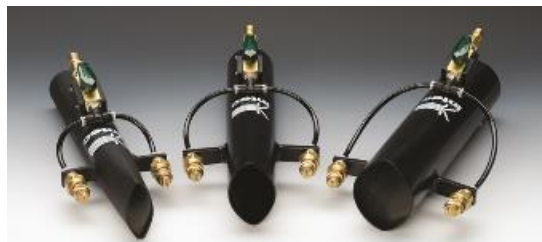
Part#: K3000 Part#: K3001 Part#: K3002 2" inlet 2-1/2" inlet 3" inlet