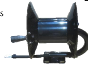
Gen 3 Hose Reel