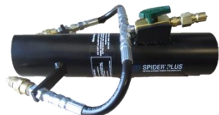
JM Spider PLUS Utility Nozzle Part#: J53000-01-S

Intec offers a large assortment of Spray Tips & Filters