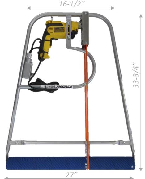
scrubber FORCE® XF27

Compliment with an Intec Recycle Hood, Fluid Delivery System, or Wall Spray Nozzle (see reverse)