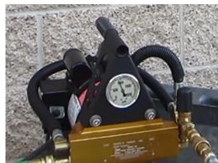
up to 1,200 psi output