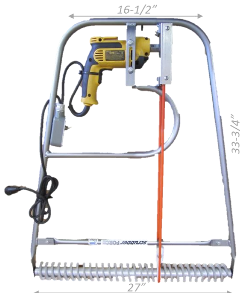
scrubber FORCE® XC27