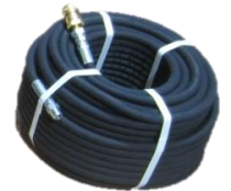
3,000psi high pressure hose