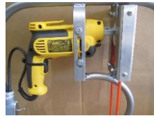
Belt Safety Shield