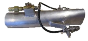
Part#: K3206-01 2-1/2" inlet